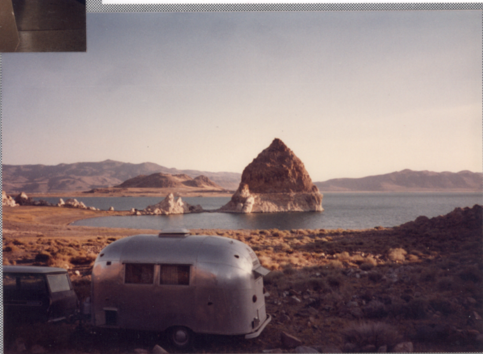
Camping at Pyramid Lake early 80's