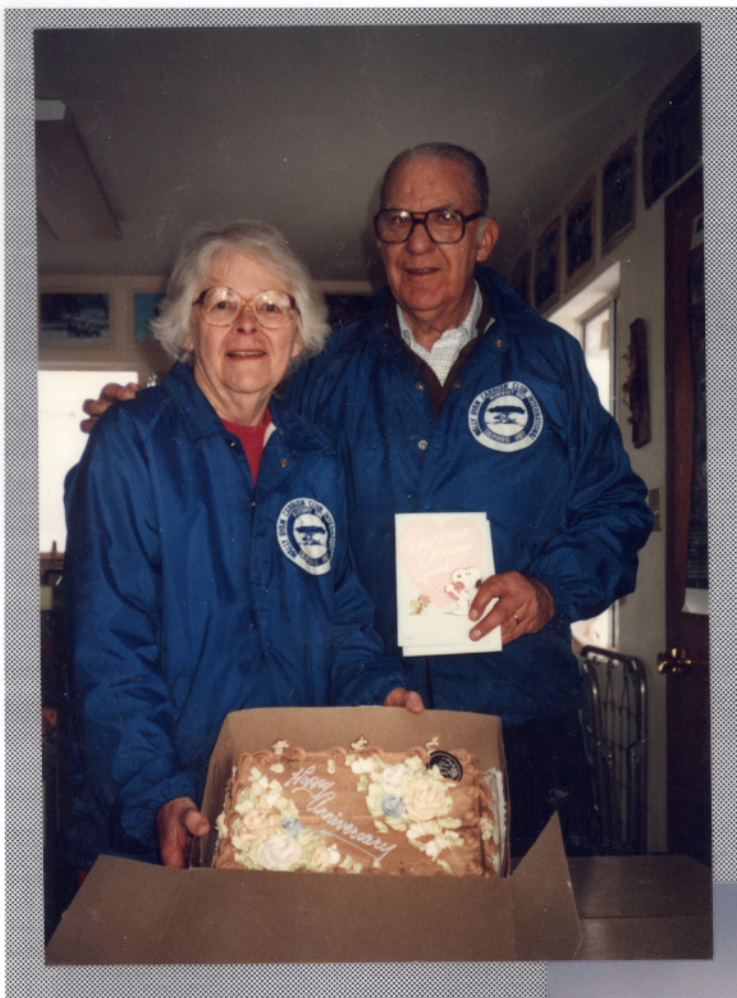
Anniversary in Chloride, AZ